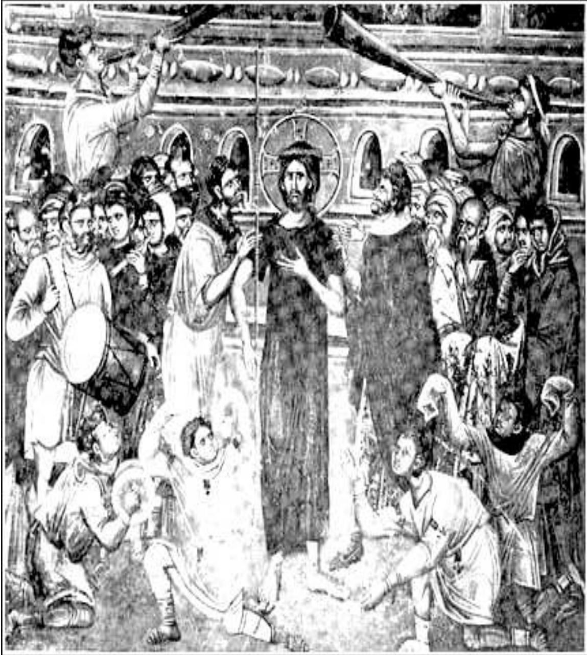
The Mocking of Jesus, 1315 A.D