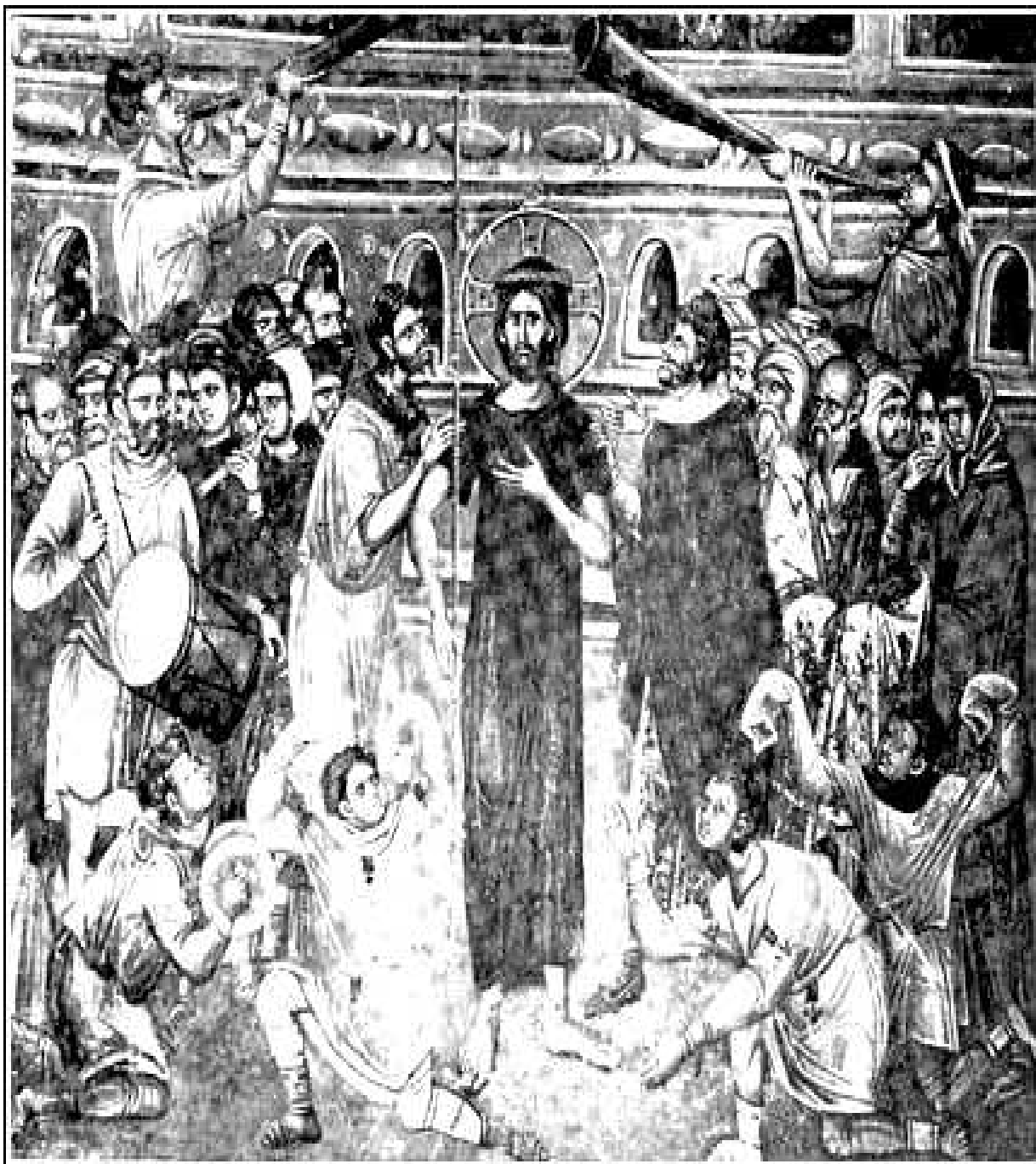
THE MOCKING OF JESUS, 1315 A.D