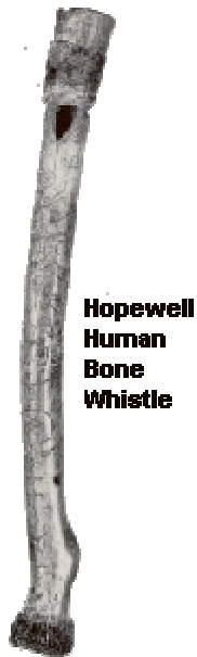
Hopewell Human Bone Whistle